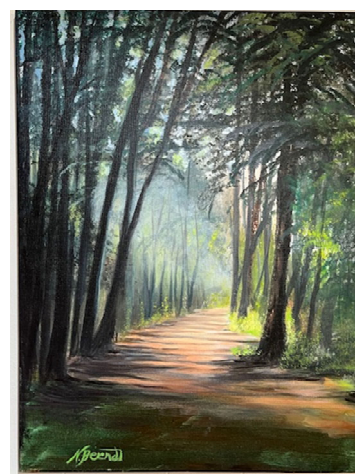
Into the Woods