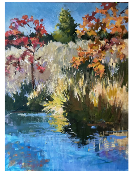
Untitled by Allen Kriegshauser