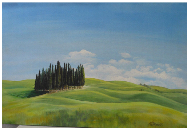
Hills of Tuscany