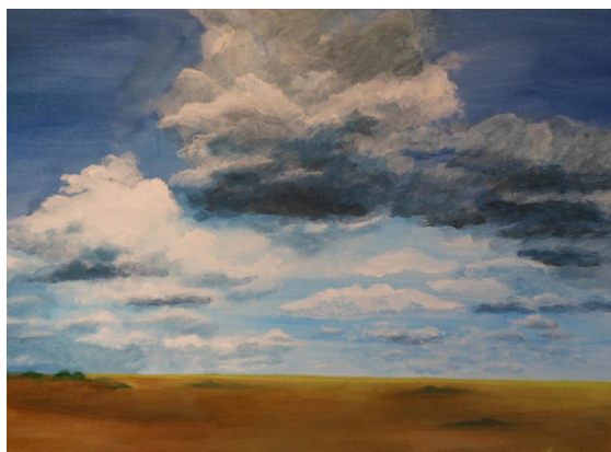
Big Sky, The Plains