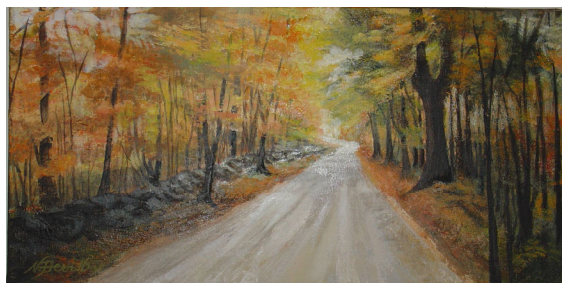
Country Road Fall